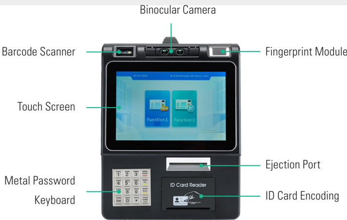
A variety of input options for easy handling