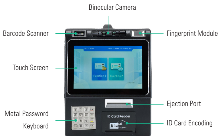
A variety of input options for easy handling